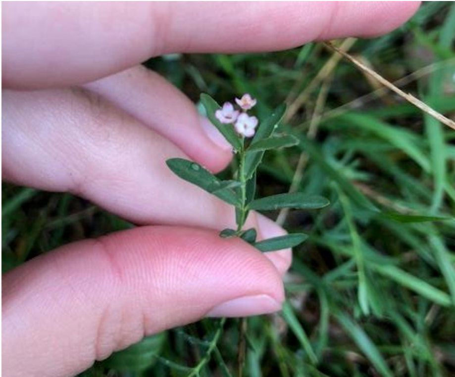
Figure 3: Pimelea spicata identified in the study area in July 2020