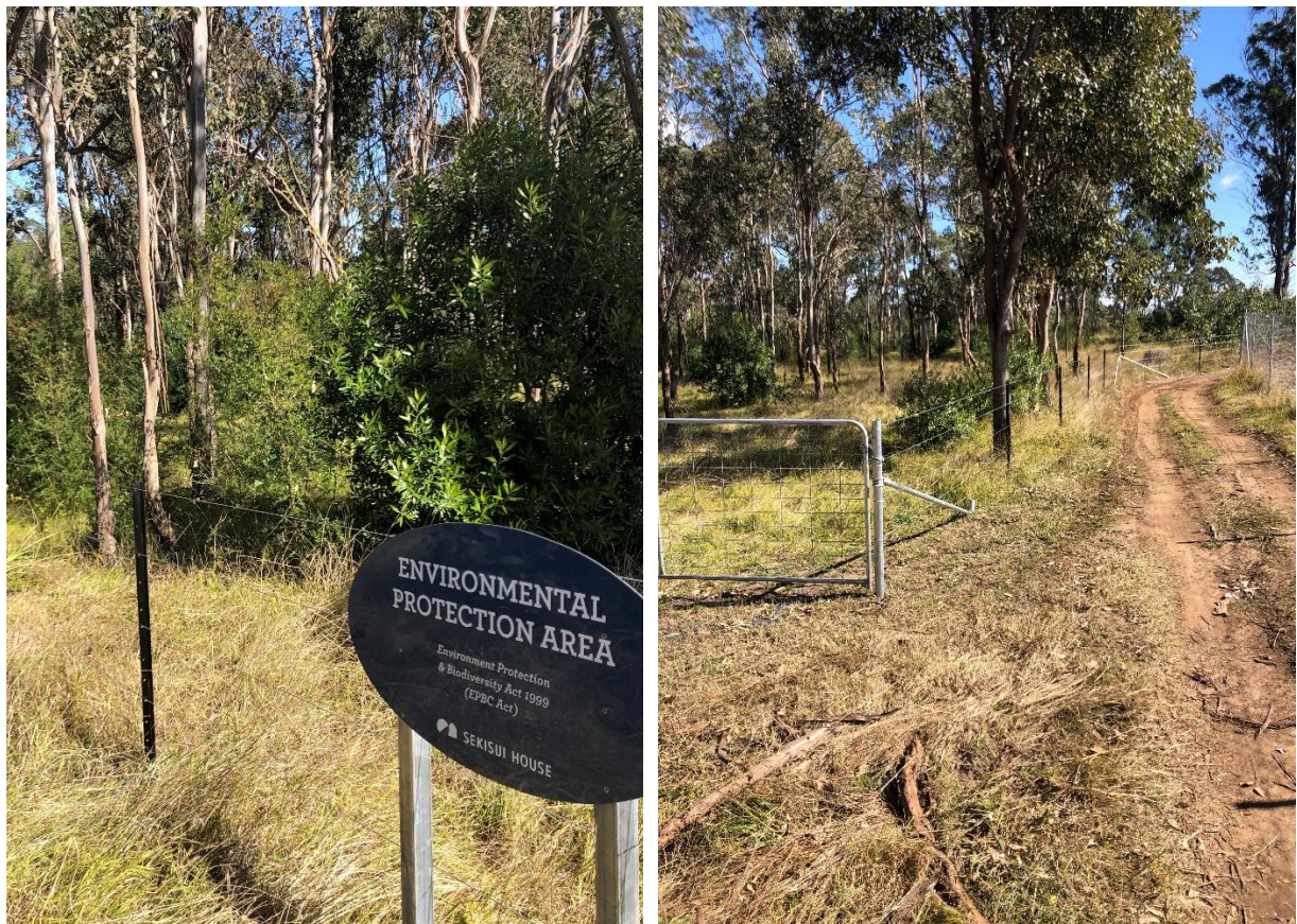
Figure 4: Exclusion fencing and signage surrounding Pimelea spicata population within larger patch of Cumberland Plain Woodland to be retained