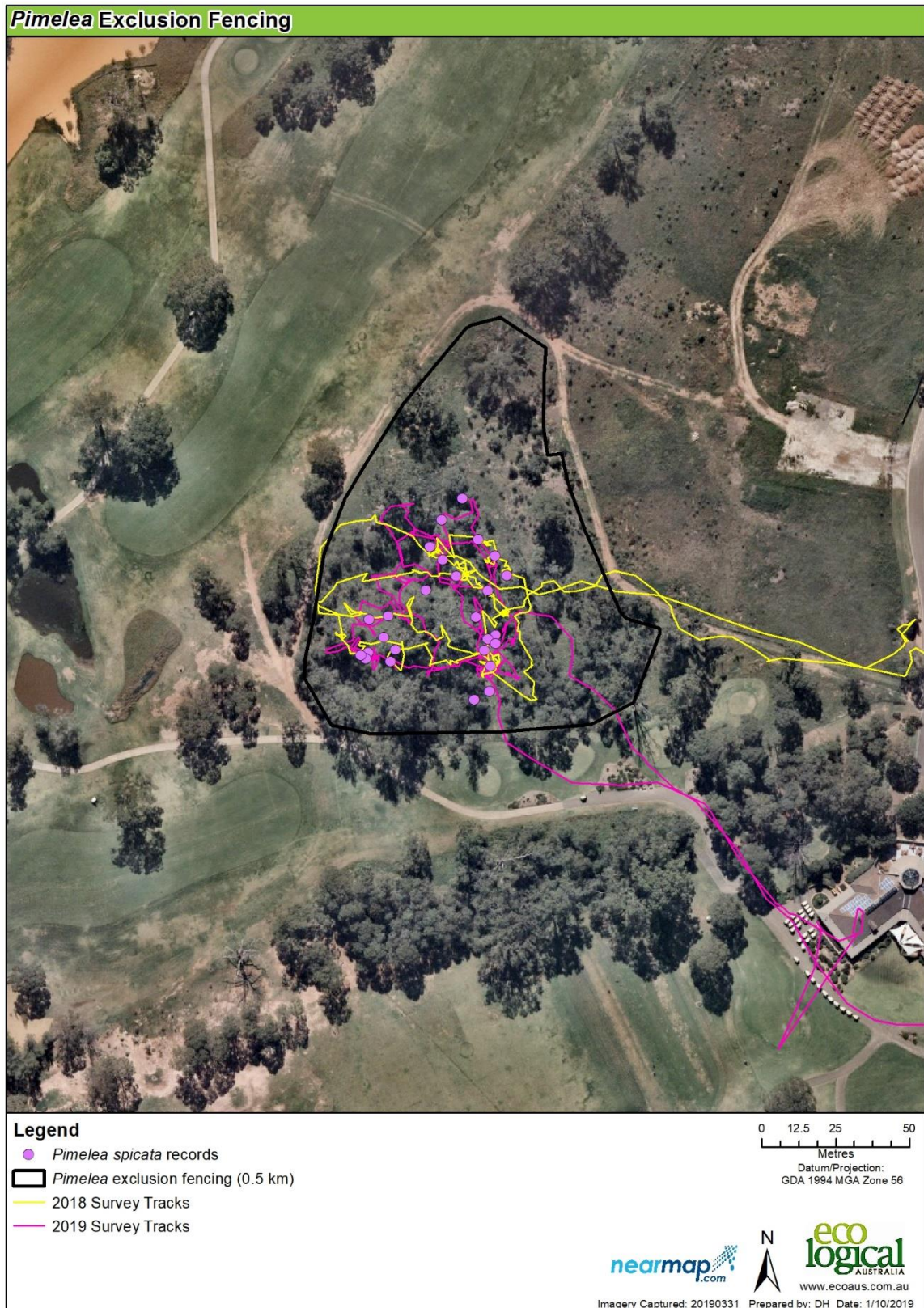
Figure 5: Pimelea spicata (records and tracks from 2019 and 2018 (tracks only) within the Lakeside Golf Course. Note: fencing is indicative of the 1 ha of Cumberland Plain Woodland to be retained only