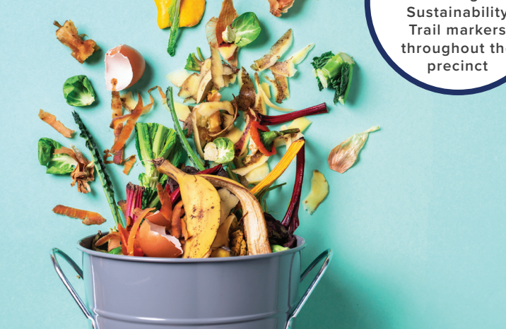
LOOK FOR the Heritage and Sustainability Trail markers throughout the precinct

Enjoy splashing in the water play garden near Boundary Street. The water jets use clean recirculated water treated by our on-site water treatment system. The sensory gardens have a mix of plants to appeal to your senses. Throughout West Village you'll find herbs for tasting and smelling; textured plants for touching; flowers for seeing and smelling; and coloured foliage to create a living green artwork.