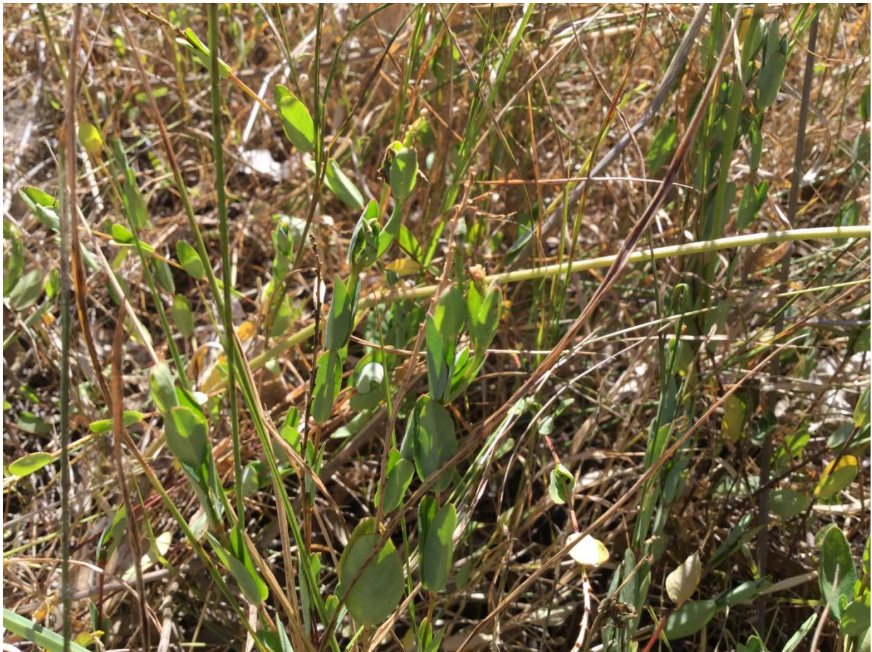
Figure 2: Spiked rice flower in situ (November 2016)

Surveys were conducted on 25 November 2016 by ELA restoration ecologist Andrew Norvill to ensure that the population of Spiked Rice-flower was in a healthy condition. 164 individuals were counted ( Figure 2 ). The patch was noted to be dry due to a recent lack of rainfall. Weed species were present ( Phalaris sp., Briza subaristata , Araujia sericifera and a small number of Olea europaea subsp. cuspidata ). Overall the patch was noted to be in good condition.