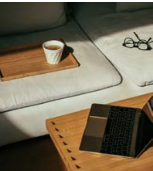
SPACE TO WORK FROM HOME