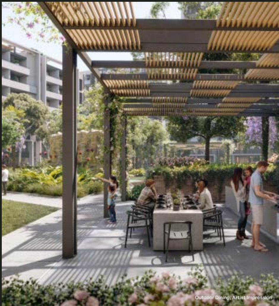
Outdoor Dining, Artist Impression