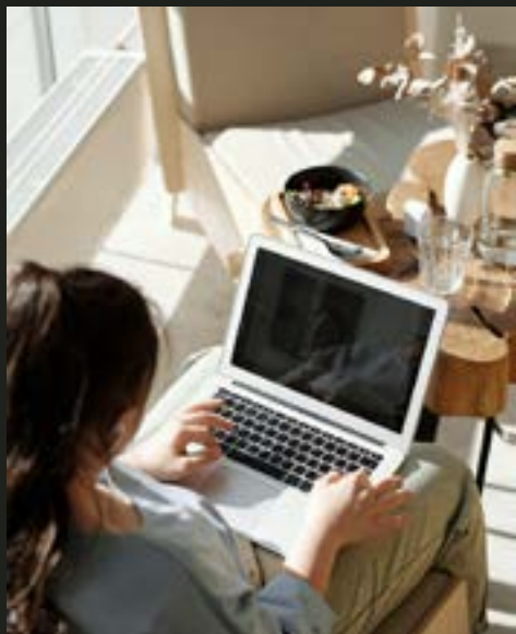
ONE PLUS STUDY