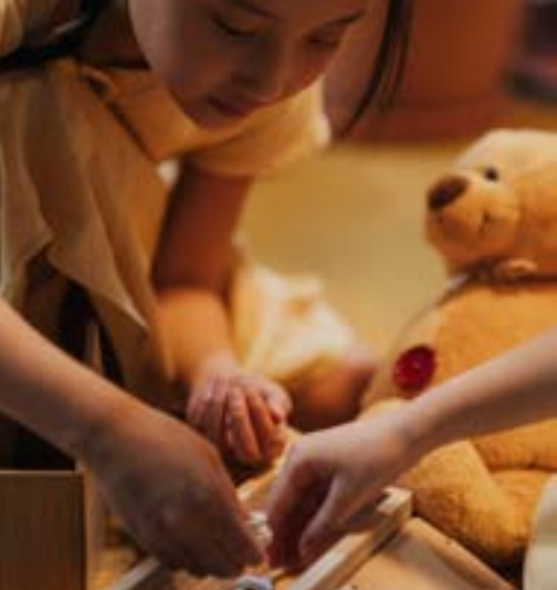
SPACE FOR THE KIDS