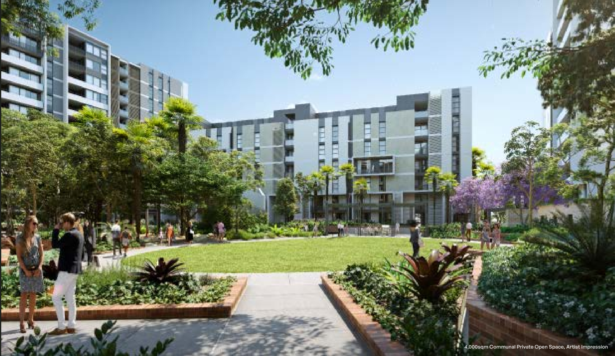
4,000sqm Communal Private Open Space, Artist Impression

With a supermarket for daily essentials, select retail and a popular café overlooking the Village Green, life is good knowing everything you need is right here.