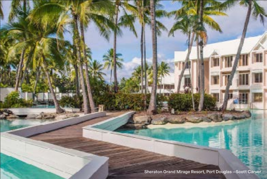
Sheraton Grand Mirage Resort, Port Douglas —Scott Carver

A living entity with a timeless tradition, the natural landscape is widely acknowledged for its positive effect on human wellbeing, providing relief in a modern world, abating stress and connecting people to themselves.