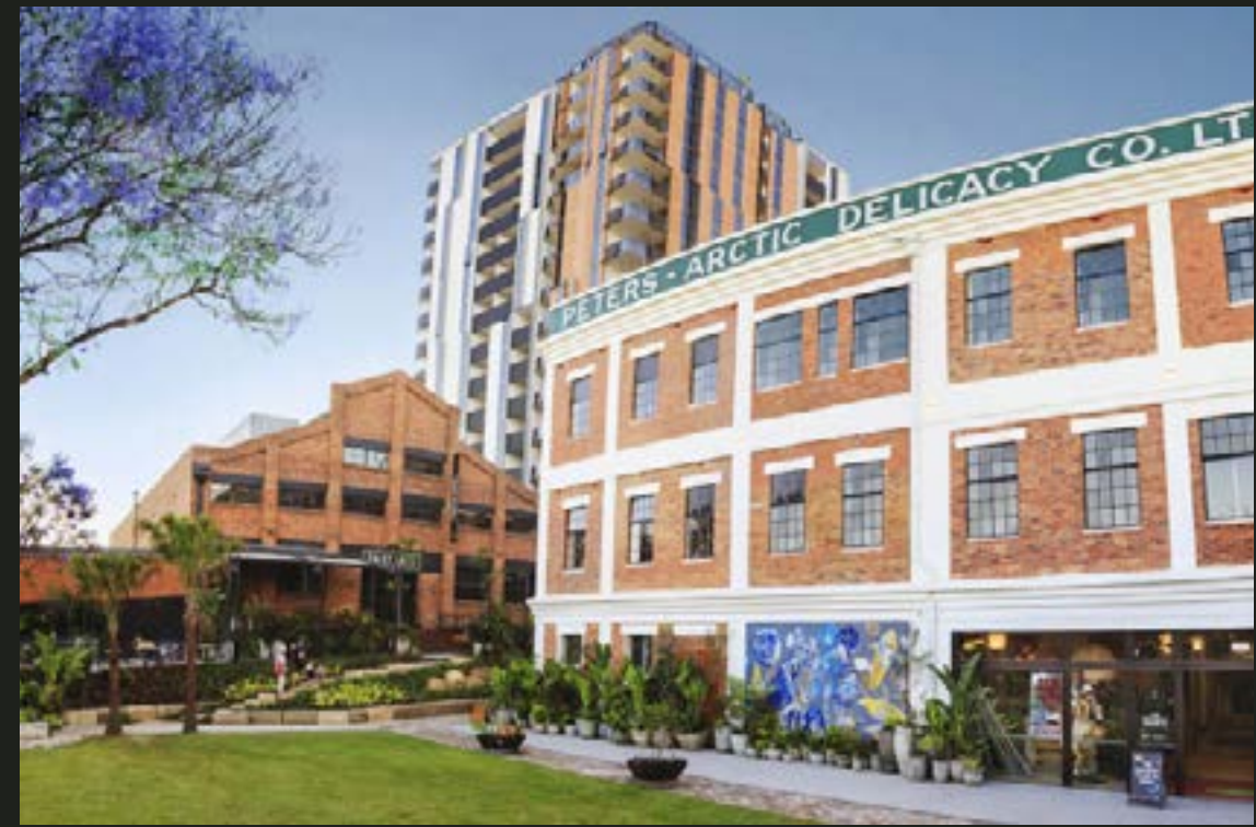
WEST VILLAGE, WEST END, QLD

Sekisui House create homes and communities that improve with time and last for generations. This is made possible by a commitment to outstanding quality that runs deep. Drawing on a rich Japanese heritage and 60 years of international experience, we deliver places with care, consideration and precision. Enabling communities to grow and flourish in connection with nature. Ensuring everything we do stands the test of time.