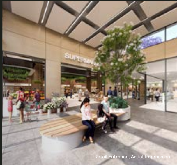
Retail Entrance, Artist Impression

With a supermarket for daily essentials, select retail and a popular café overlooking the Village Green, life is good knowing everything you need is right here.