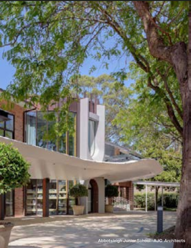
Abbotsleigh Junior School—AJC Architects

The team delivers award-winning projects including individual homes grouped dwellings and medium to high-density housing projects in mixed-use and residential settings.