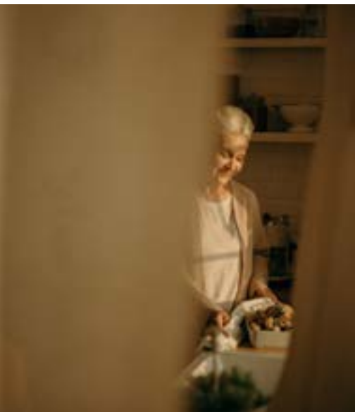
SPACE FOR A GRANDPARENT