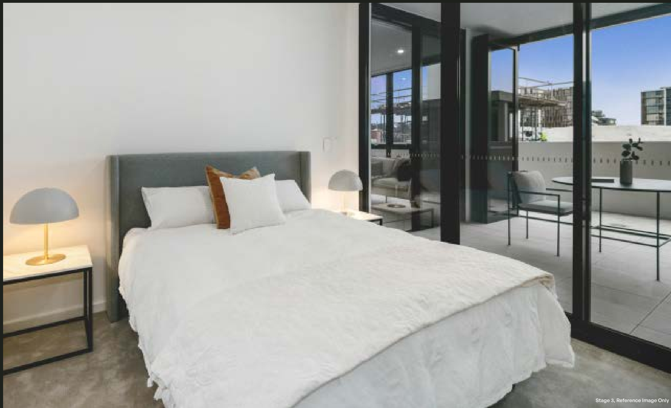
Stage 3, Reference Image Only

Looking to push your money further? At an average of 78sqm, the One Bedroom Plus gives you the size and flexibility of many two bedroom apartments—without the price tag. You've got oversized living, bedroom and balcony spaces big on natural light. Plus a study offering endless options—whether it's work from home, space for the dog, a nursery or for friends to stay after Saturday night dinners.