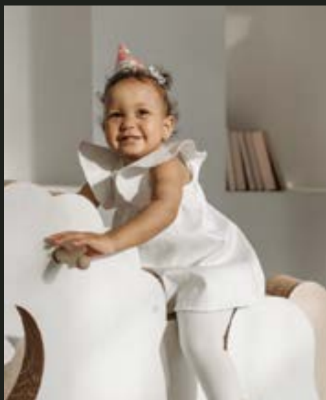
ONE PLUS NURSERY