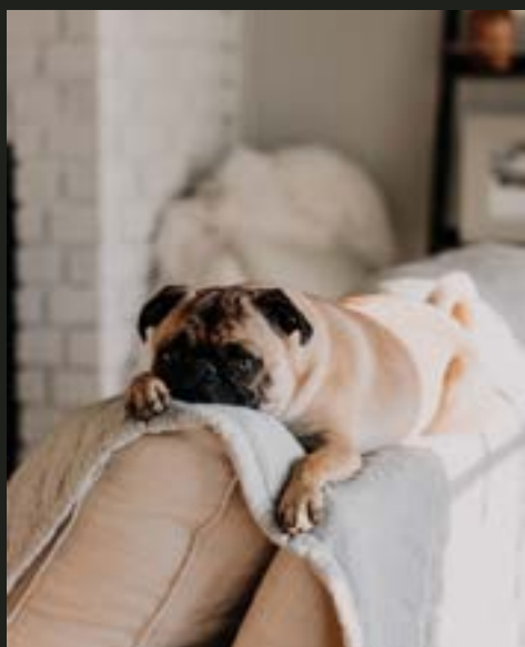
ONE PLUS PET SPACE