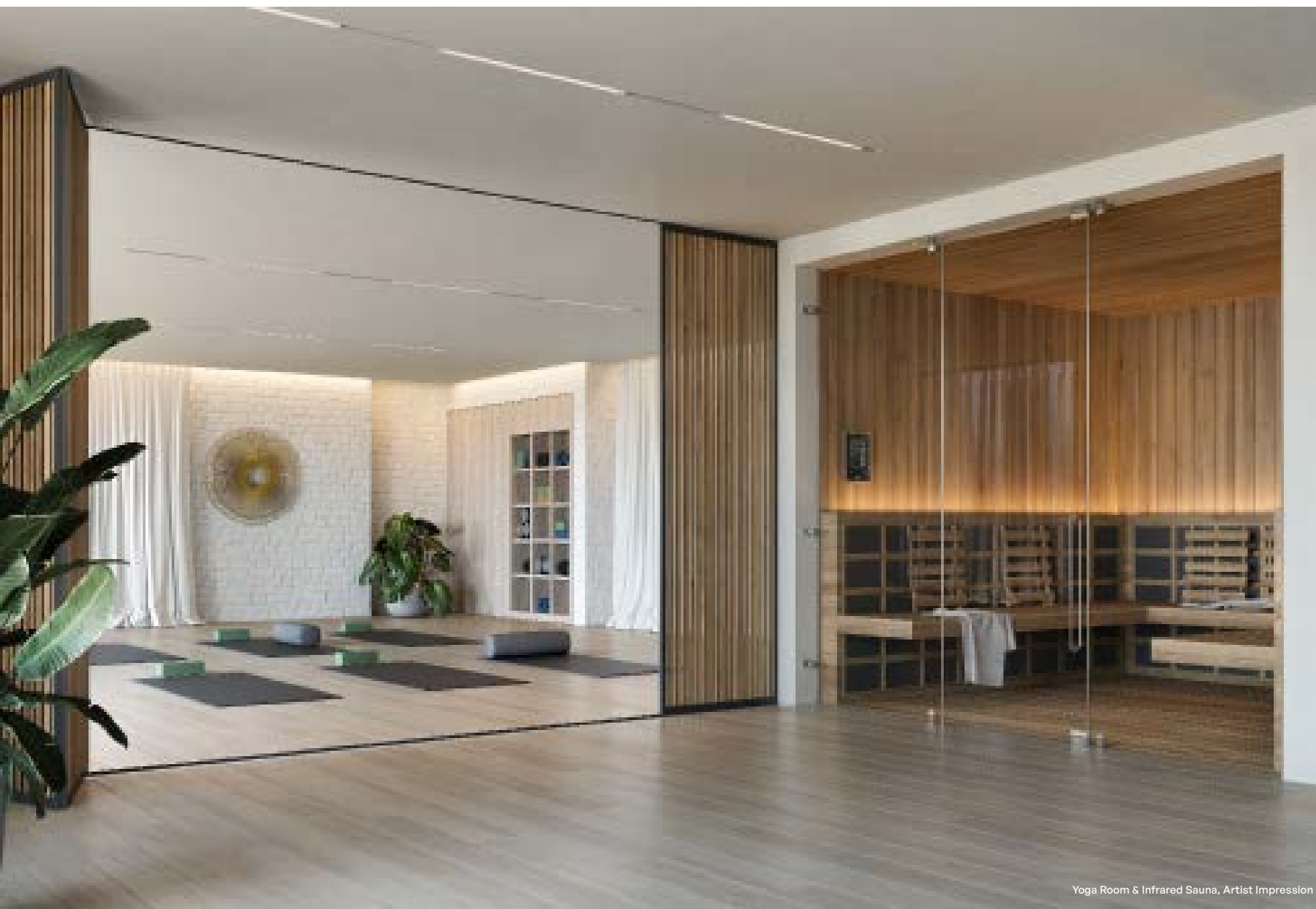
Yoga Room & Infrared Sauna, Artist Impression