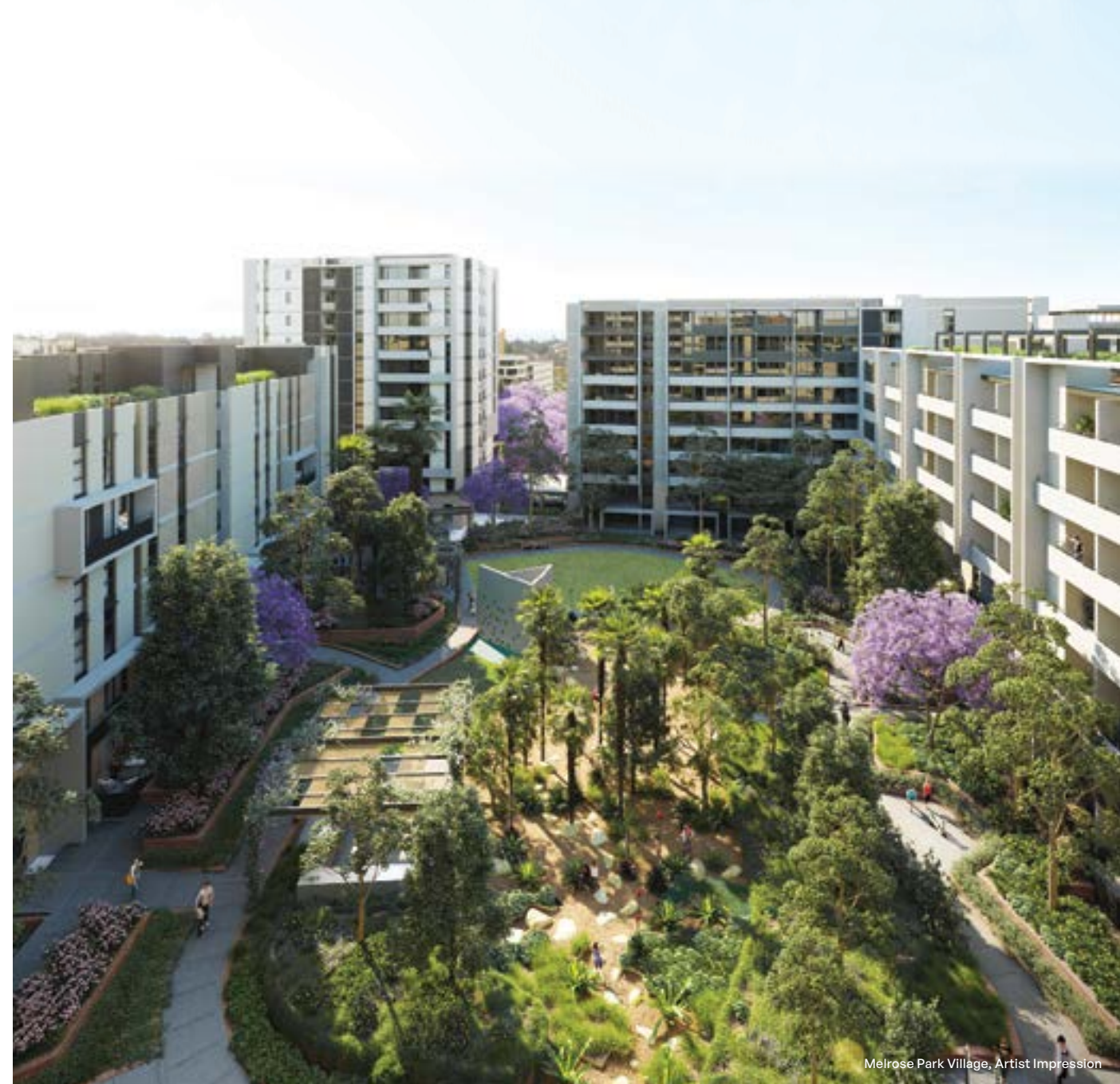
Melrose Park Village, Artist Impression

Melrose Park Village gives you the room to live life to the fullest. You can relax in oversized, adaptable spaces to call home—even as life changes—and be part of a growing multicultural community. As an early investor, you'll see strong capital growth. With green spaces at your door and a landmark Central Park due in 2027, this is your opportunity to leave the inner-city bustle behind and breathe easy.