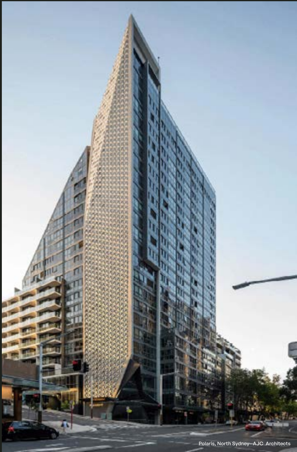
Polaris, North Sydney—AJC Architects

AJC Architects are a leading architectural practice offering a diverse spectrum of architectural and professional services for a range of residential and commercial developments. Their vision is to produce creative, sustainable and innovative design solutions that sympathetically respond to the community and environment.